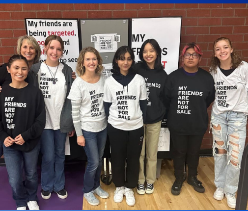
Heritage DECA collaborated with non-profit, The EPIK Project, to spread awareness on the exploitation of minors.

92% OF DECA MEMBERS REPORT THAT DECA EXPERIENCES EMPOWERED THEM TO BECOME AN EFFECTIVE LEADER OF DECA MEMBERS REPORT THAT DECA EXPERIENCES CONNECTED SCHOOL TO THE REAL WORLD FOR THEM OF DECA MEMBERS REPORT THEY GAINED SKILLS TO