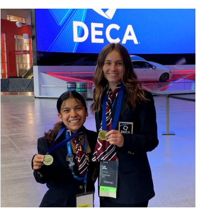
Washington DECA members swept DECA's International Competition by placing as the top association in the world with thirty Top 3 teams.