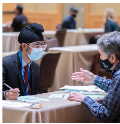
Our organization created the first student-led Diversity, Equity and Inclusion Student Ambassador Team who executed several initiatives in support of a more inclusive organization.