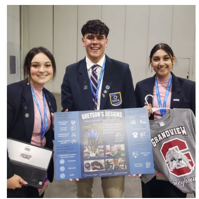
In the fall, 500+ members received the DECA Cards, a mobile-app in partnership with Virtues Matter and the #SharetheLOVEDECA initiative, aimed to help students build a culture of appreciation, connection and self-care.